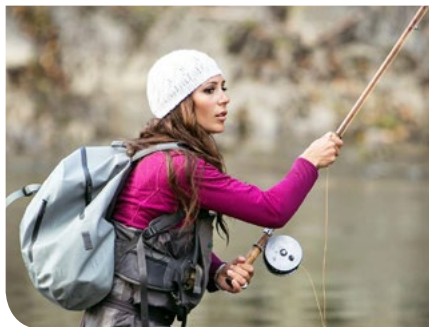
SHORELINES WITH APRIL VOKEY