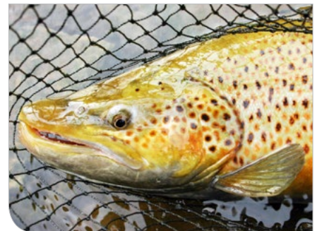
WORLD FISHING JOURNAL

For a full list of programs visit: WorldFishingNetwork.com/Schedule