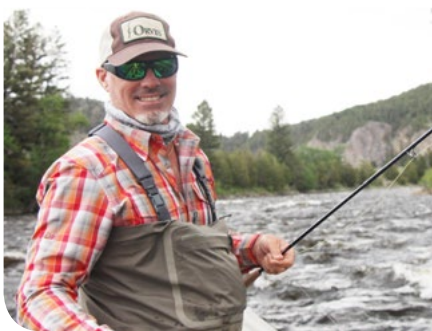
50 PLACES TO FLY FISH BEFORE YOU DIE