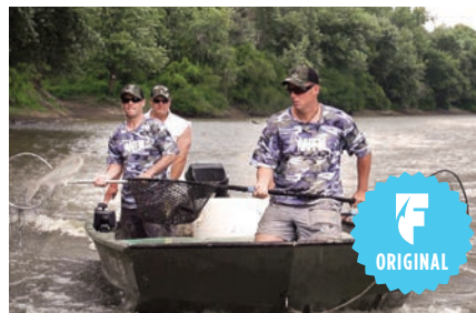
WORLD FISHING JOURNAL SUNDAY 11:30 AM ET