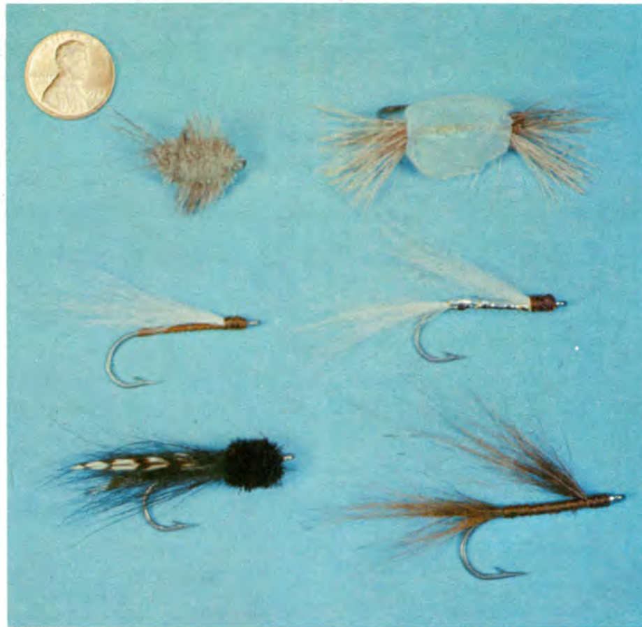
Basic hatchmatchers: crabs (top), worms (left) and shrimp

Write for Brochure: DAVID McNEESE 409 Sunshine Acres • Eugene, Ore. 97401 (503) 342-1025 [Evenings]