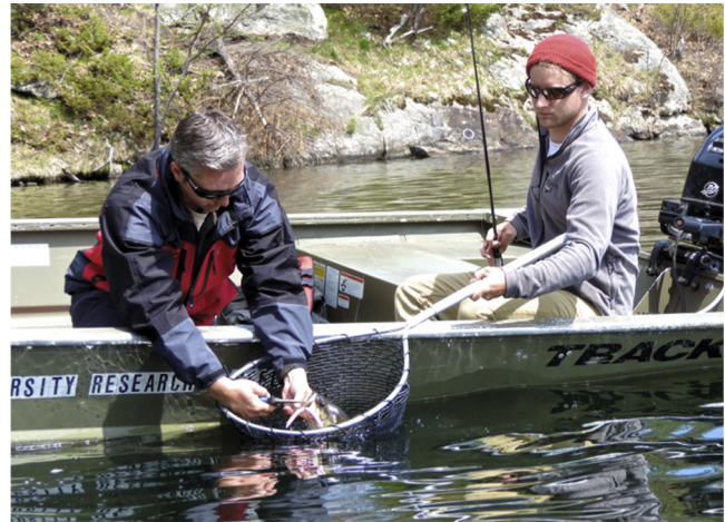
Fig. 2. Anglers using a rubberized landing net to hold a largemouth bass in water during the unhooking process.

While experimental evidence shows that longer retrieval durations increases physiological stress responses of angled fish, many studies using appropriate retrieval gear for the target species have found little correlation between retrieval time and fish condition. For example, while Gustavson et al. (1991) showed in experimental simulations that longer angling times (up to 5 min) caused significantly greater physiological stress in largemouth bass ( Micropterus salmoides ), in real angling scenarios, Brownscombe et al. (2014c) found no association between physiological stress or reflex impairment with retrieval times or total fish fight intensity in this species using typical largemouth bass angling gear (medium strength rods and 7 kg break strength line). Other studies have had similar findings using typical gear for the target species in both freshwater and marine species (Landsman et al., 2011; Thorstad et al., 2003; Danylchuk et al., 2007; Danylchuk et al., 2011). Conversely, retrieval duration appears to be a more important